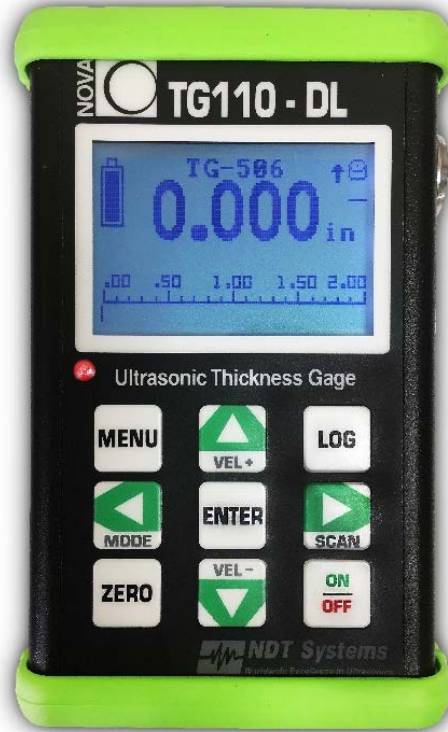
Customizable Data Logger