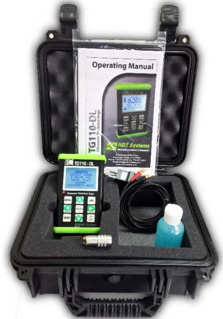
TG-110 Package including a probe