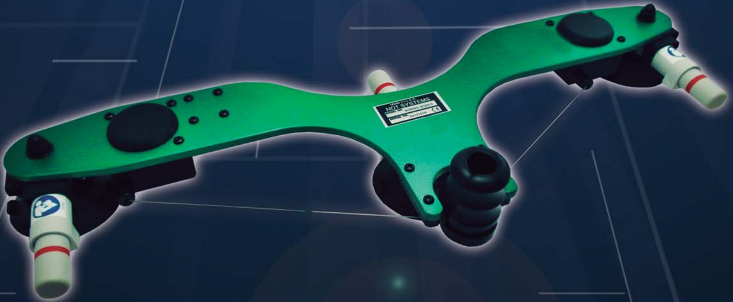
StringScan II Manual X-Y Scanner for Ultrasonic inspection of flat or slightly curved surfaces