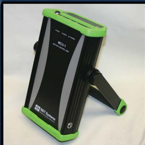
MCU-1 Battery Control Unit