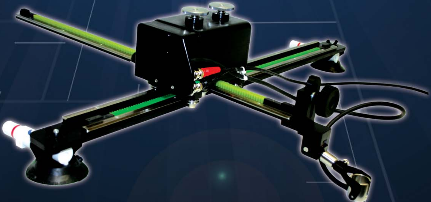
CrosScan- Automatic scanner for ultrasonic inspection of flat or slightly curved surfaces