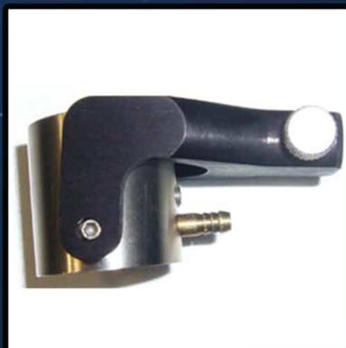
Standard probe holder